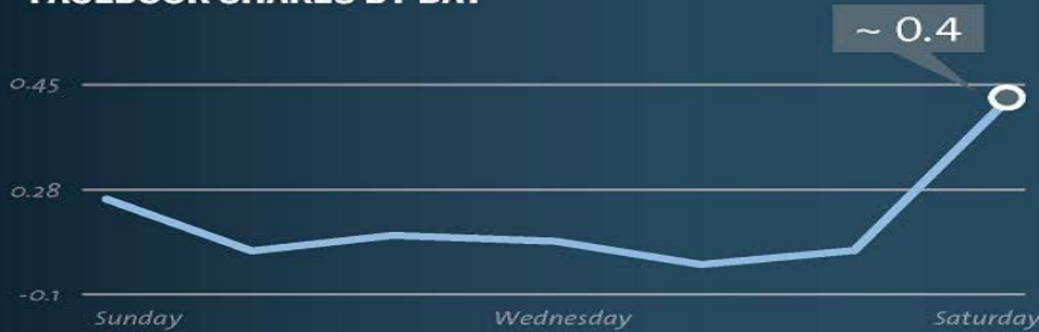
FACEBOOK SHARES BY DAY