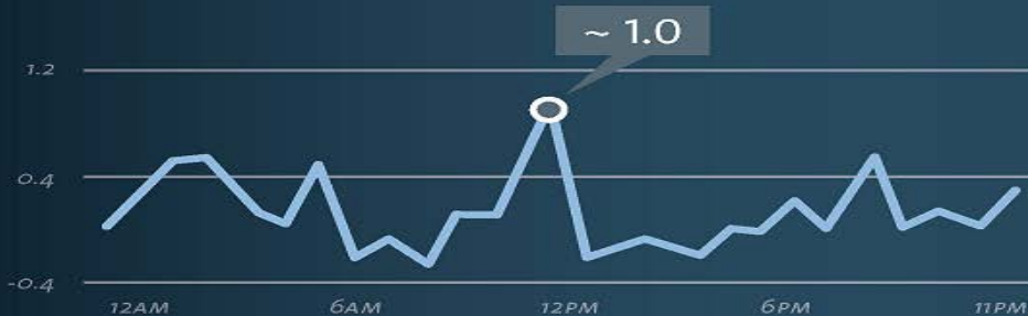
FACEBOOK SHARES BY HOUR

Most Facebook sharing is done on Saturday .